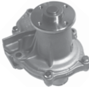
FWP1968 1.6 (4-AFE) - Pump with Backhousing