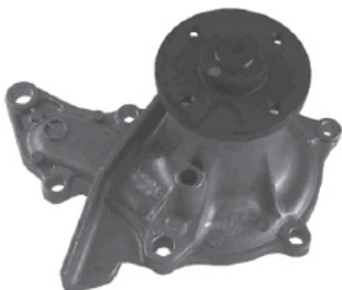
FWP1692 1.8 (7-AFE) - Pump Only