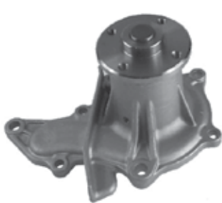
FWP1645 1.6 (4-AFE) - Pump Only

FWP1968 (1.6) & FWP1860 (1.8) are supplied as an assembly complete with the backhousing. They will replace both Aisin and SEM manufactured Water Pumps.