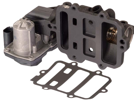
EGR valve with gasket (item no. 7.04999.34.0)

The newly installed EGR valve is not the cause of the whistling.