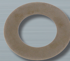
Diamond-coated crankshaft washer

In order to avoid costly consequential damage, the SWAG vibration damper repair kits for Volvo 850, S70, S80, V70 I, V70 II, VW Crafter/T4 and Audi A6 include the diamond-coated crankshaft washer.