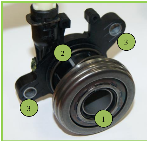
New design of 804526 / 804570